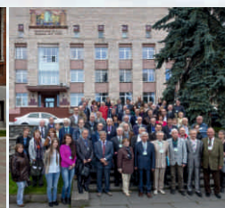
XII 2015 Petrozavodsk «Petrography of magmatic and metamorphic rocks»