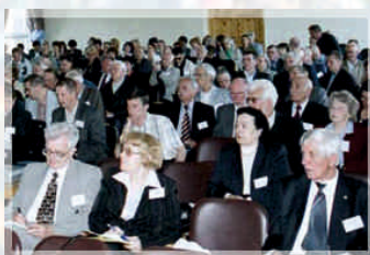
X 2005 Apatity «Petrography of XXI century»