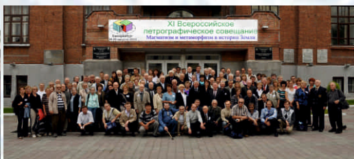
XI 2010 Ekaterinburg «Magmatism and metamorphism in the Earth history»